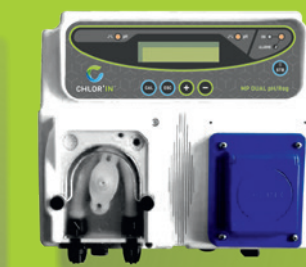
pH + Redox unit